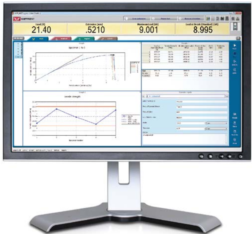
Older testing systems can now use the latest software to display test curves, calculated results, video capture of test, and data points.

Many users consider a system retrofit when the system controller becomes increasingly outdated compared to current industry standards or is incompatible with newer accessories. For example, a data acquisition rate of 20 points per second was considered “fast” twenty years ago. Current systems can acquire test data upwards to 2.5 KHz—providing a truer definition of the test curve profile, uncover-