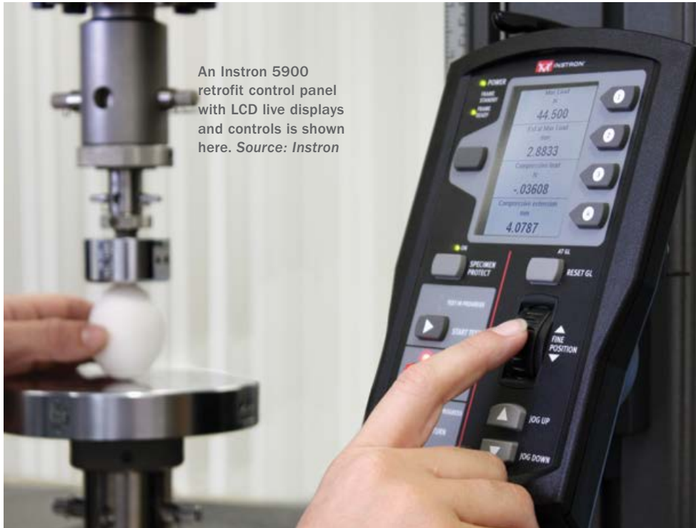
An Instron 5900 retrofit control panel with LCD live displays and controls is shown here.

Larger capacity floor model frames tend to be the most suitable candidates for retrofits due to the cost of a new sys-