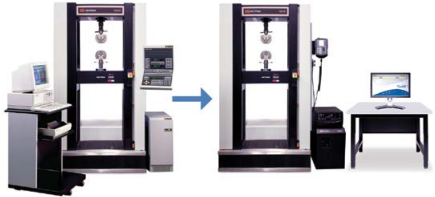
This is an example of an Instron Model 4505 produced 25 years ago retrofitted with new electronics, control panel, and software, completed in one day at a customer site.

A retrofit can be simply defined as an upgrade to an older testing system. In some cases, a retrofit may consist of only removing the controller portion and replacing it with a current generation version. More extensive retrofits may involve replacing critical components prone to failure or obsoleted such as motors or power amplifiers. Other important items to consider in a retrofit are whether the upgrade includes bringing the upgraded system to current industry standards. Most retrofits today include new software and a computer with predefined test methods to automate much of the testing process, data analysis, and reporting.