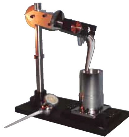
The embedding fixture ensures correct implant alignment for the test