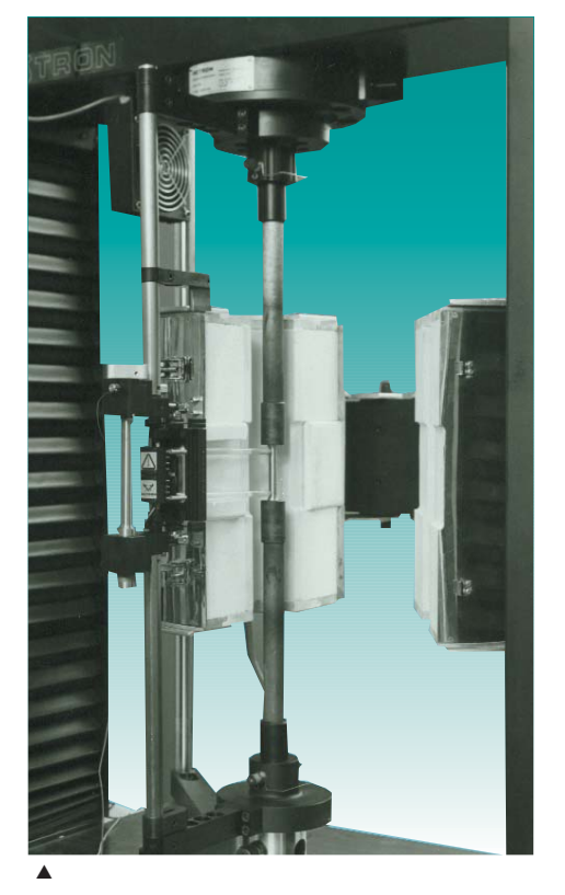
Tension only pullrods with split furnace