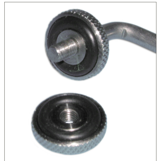
Close up of o-rings