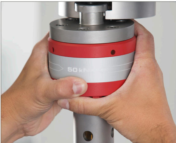
50 kN Load Cell with Quick-Mount kit