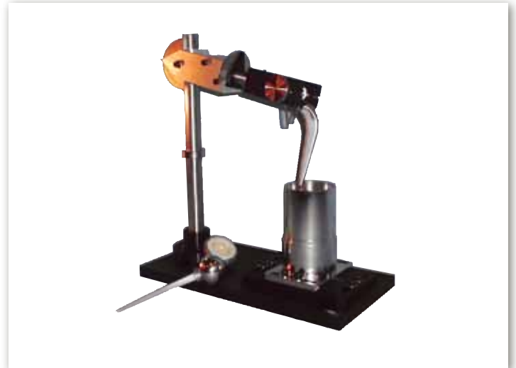
The embedding fixture ensures correct implant alignment for the test