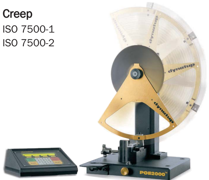
Dynatup® POE 2000 instrumented pendulum impact test machine.